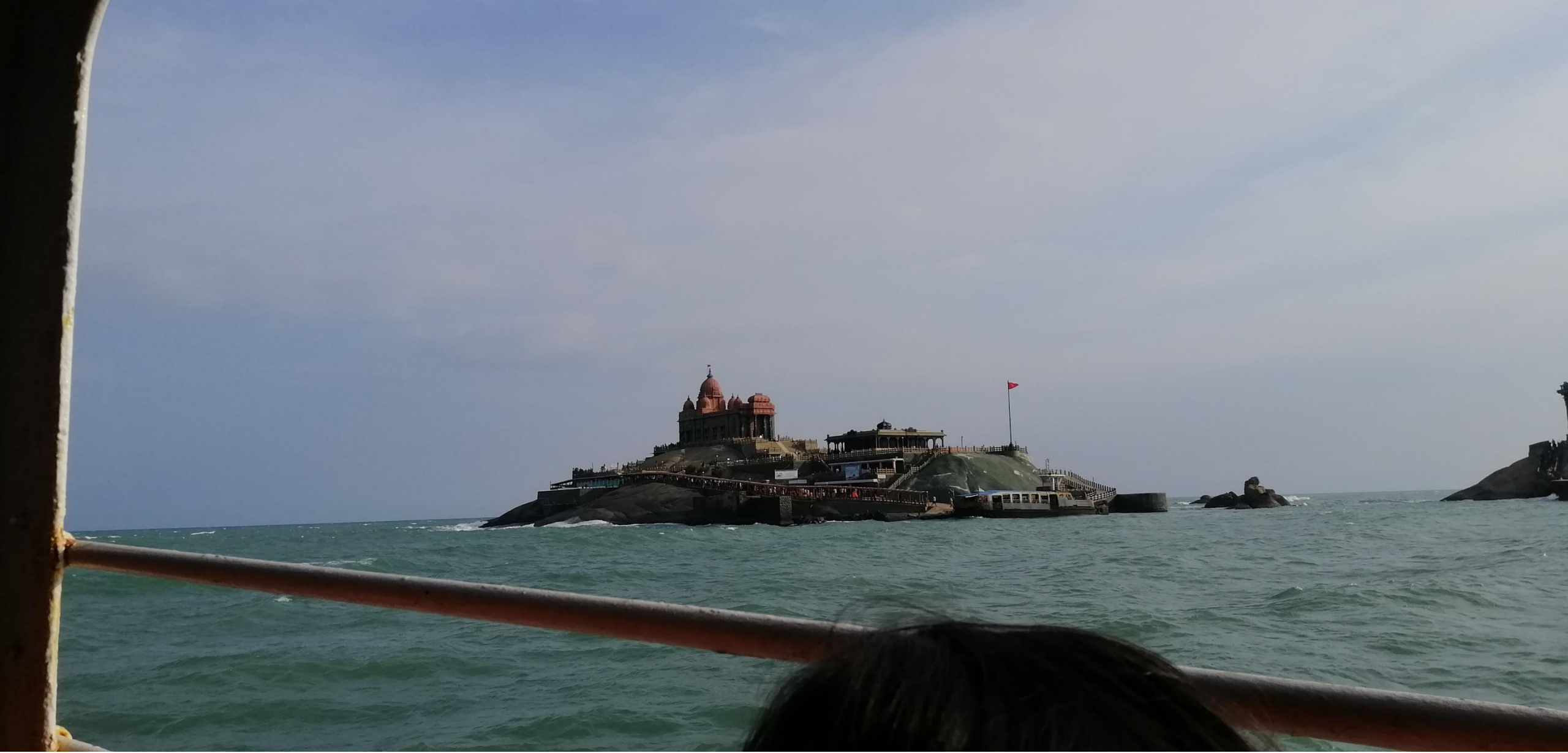
Field trip at Vivekananda Hill organized by Williams Research Centre for Presenters