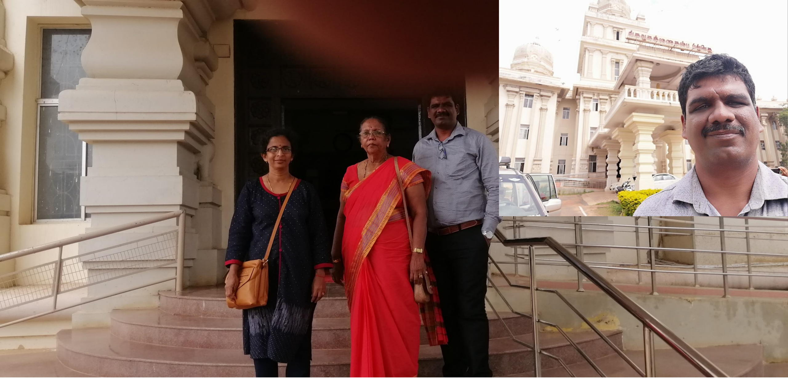
At Thanjavur Tamil University