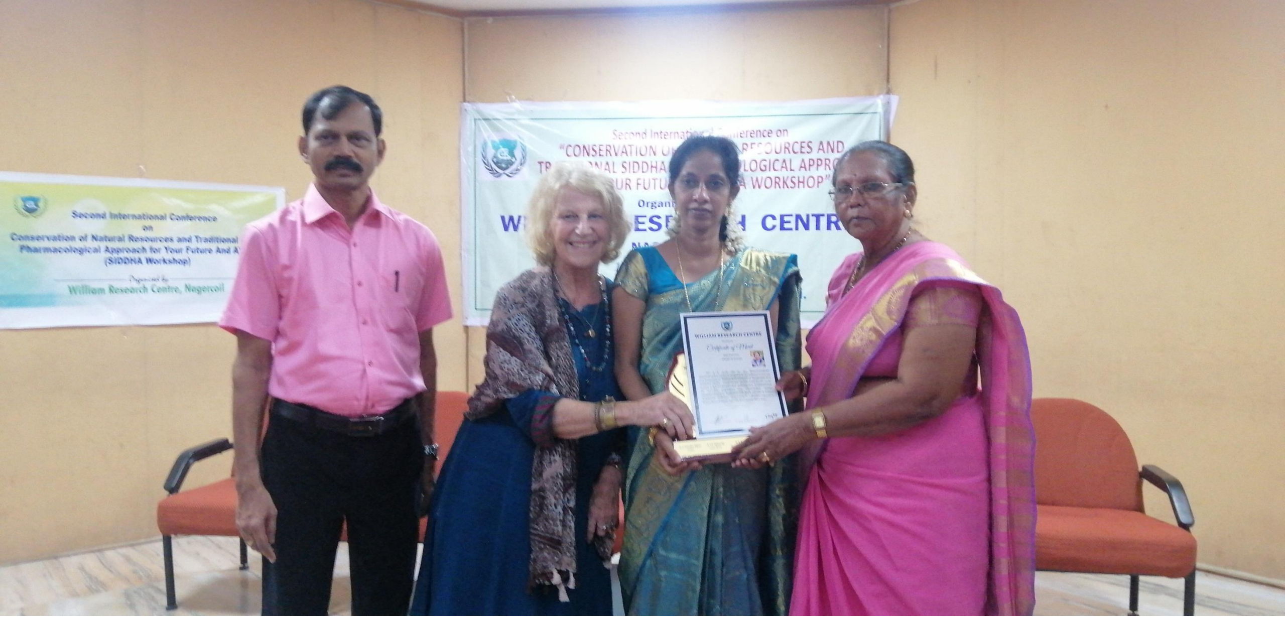
Best faculty award for Siddha Medicine - Awarded by Williams research Centre