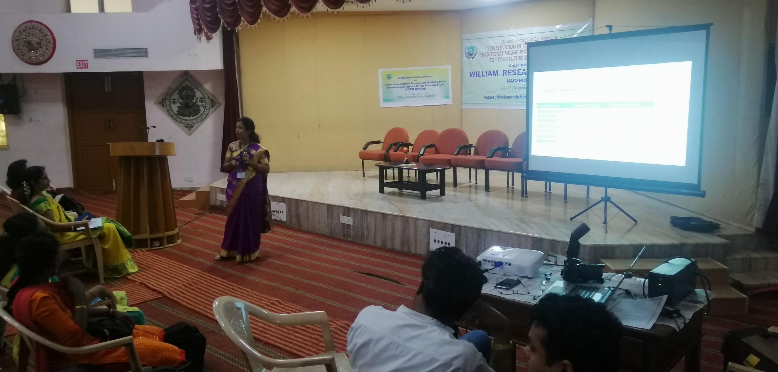
Head, Siddha Medicine Presented a paper at the International research conference