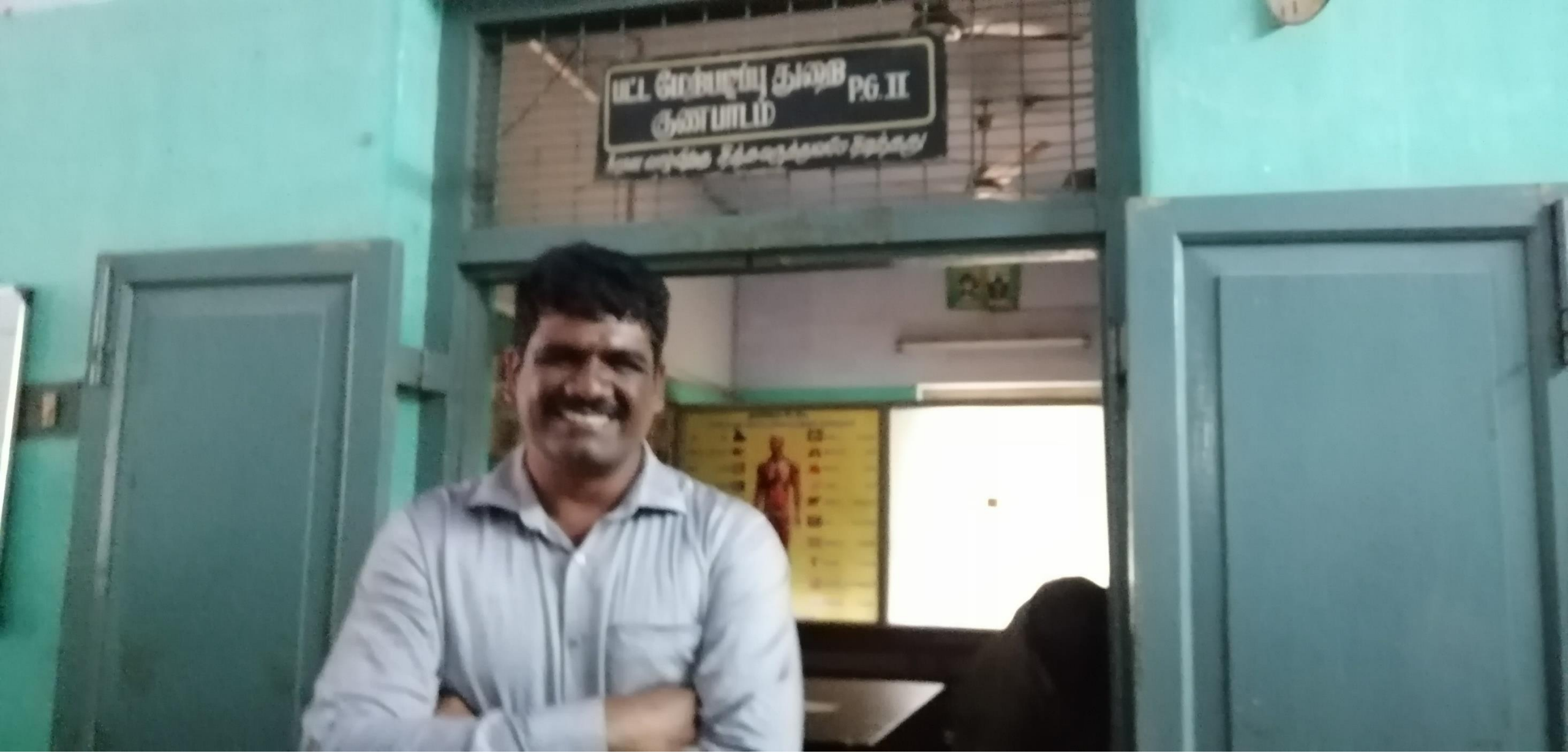
Post graduate Department of Gunapadam At GSMC PalaiyanKoddai