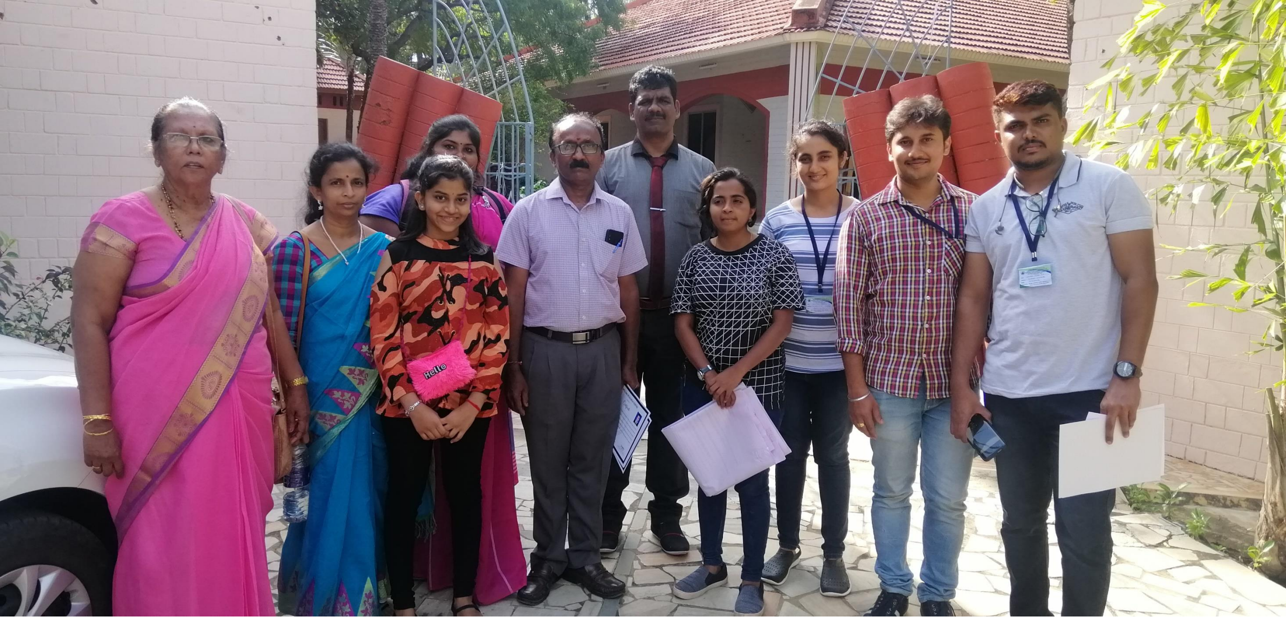
Team from USM with International presenters at Kanniyakumary for the International Research conference