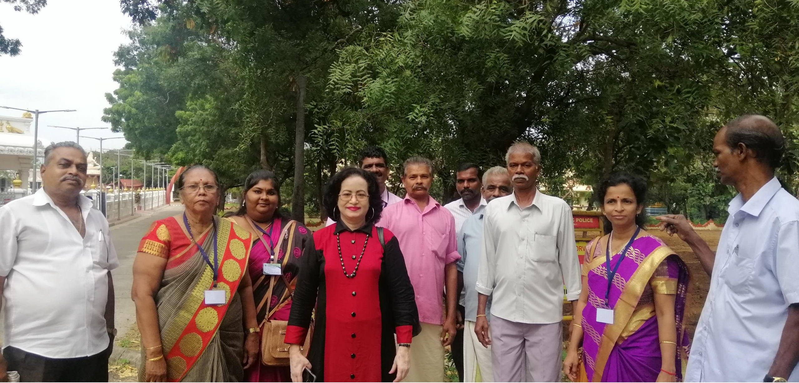
Team from USM with Indian Traditional Siddha experts at International Research conference, Kanniyakumary .