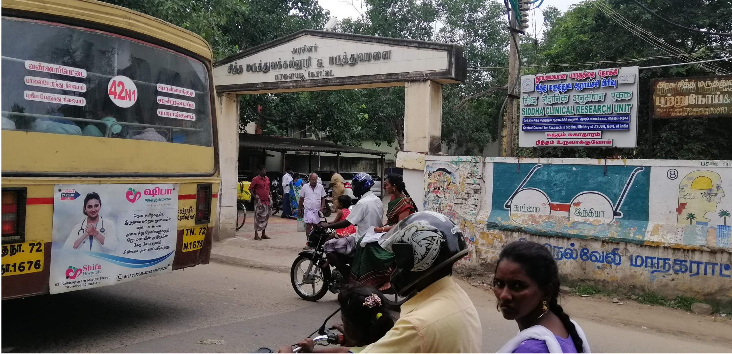
Visited to Government Siddha Medical College Palayankoddai Thirunelvely, India