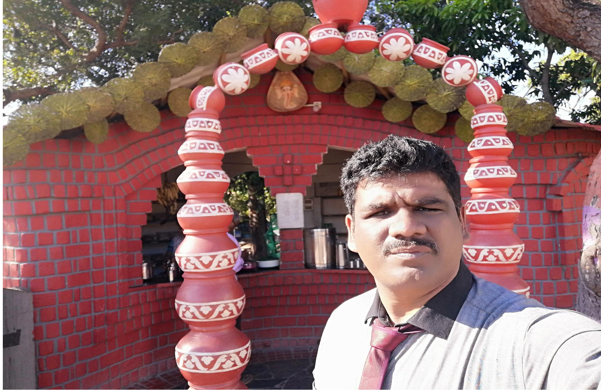
Herbal products stall at Vivekanada Kenthiram at Kanniyakumary