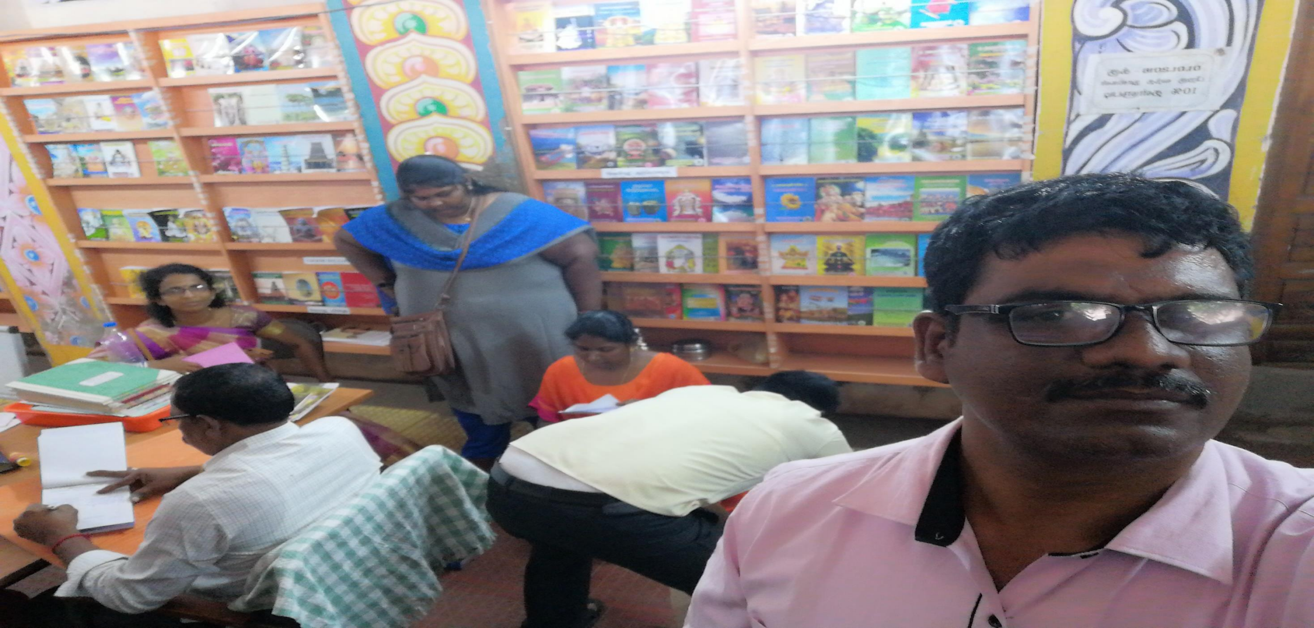
Siddha Books purchasing at Thanjai Saraswathy Mahal Library