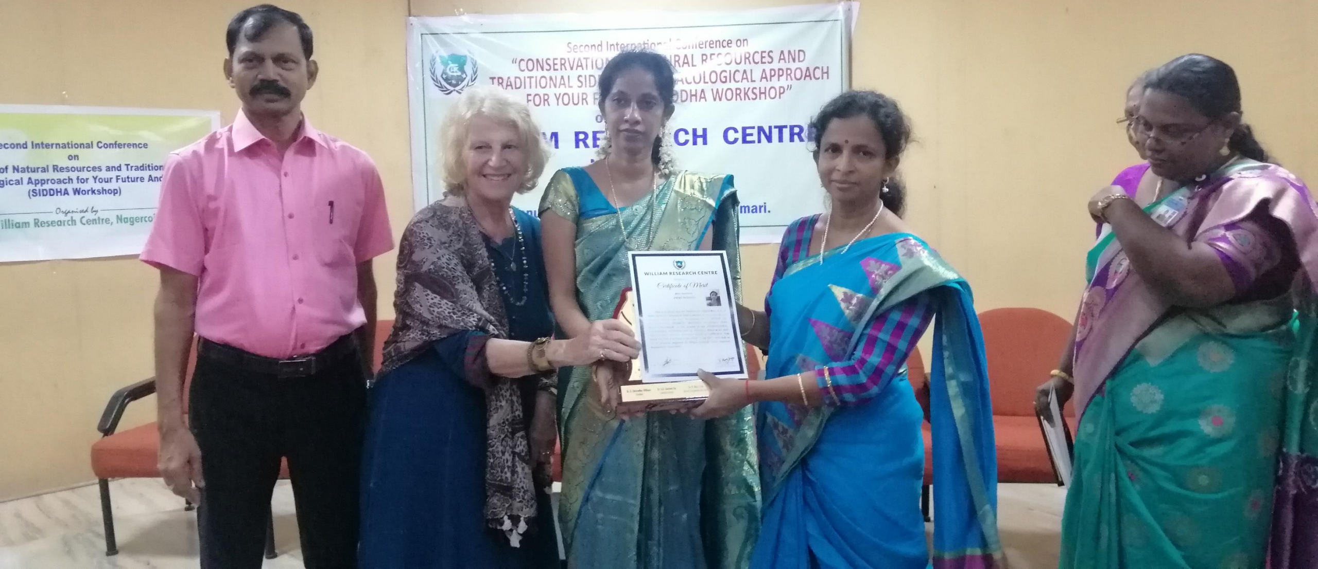
Best faculty award for Siddha Medicine – Awarded by Williams research Centre