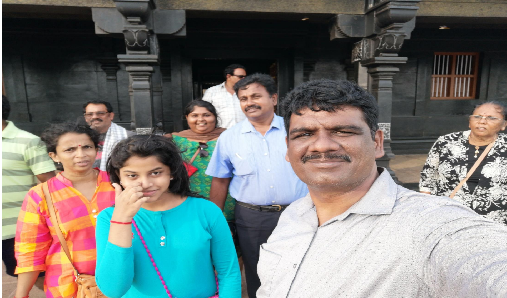
Field trip with Professor in Agriculture at Vivekananda Hill organized by Williams Research Centre for Presenters