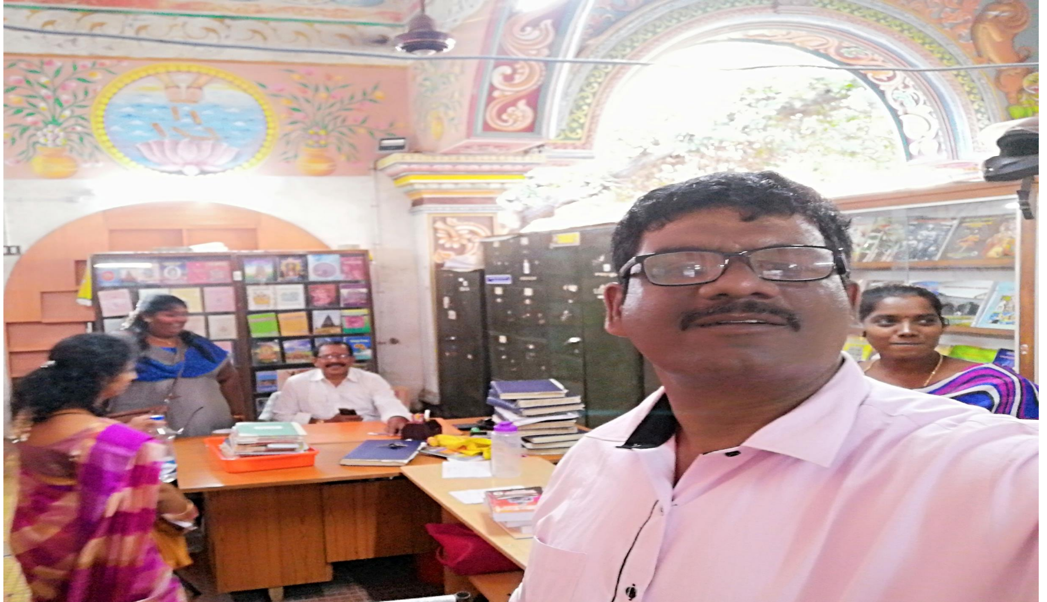
Siddha Books purchasing at Thanjai Saraswathy Mahal Library at Thanjavur