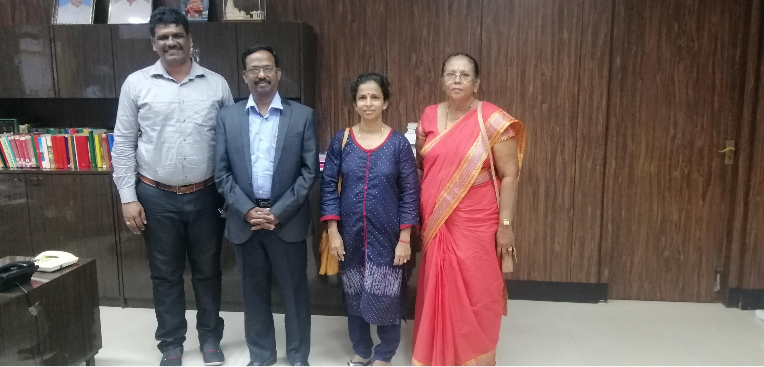
The team From Unit of Siddha Medicine, University of Jaffna with Vice-Chancellor Tamil University Thanjavur India – Discussion on MOU